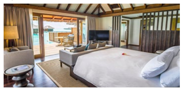
GRAND WATER VILLA NUMBER OF VILLAS: 6