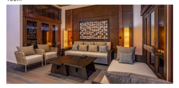
TWO-BEDROOM GRAND WATER VILLA NUMBER OF VILLAS: 5