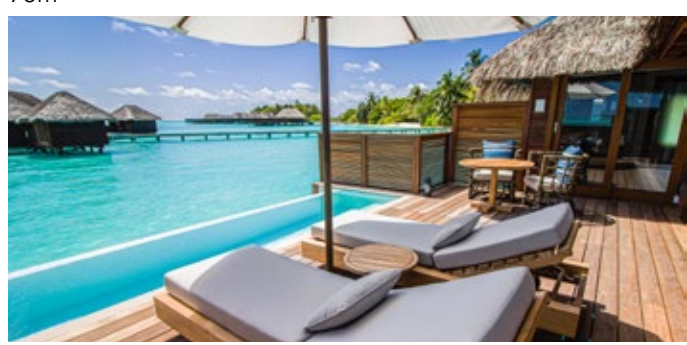
GRAND WATER VILLA WITH POOL NUMBER OF VILLAS: 6