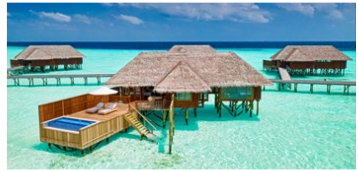
TWO-BEDROOM GRAND WATER VILLA WITH POOL NUMBER OF VILLAS: 4