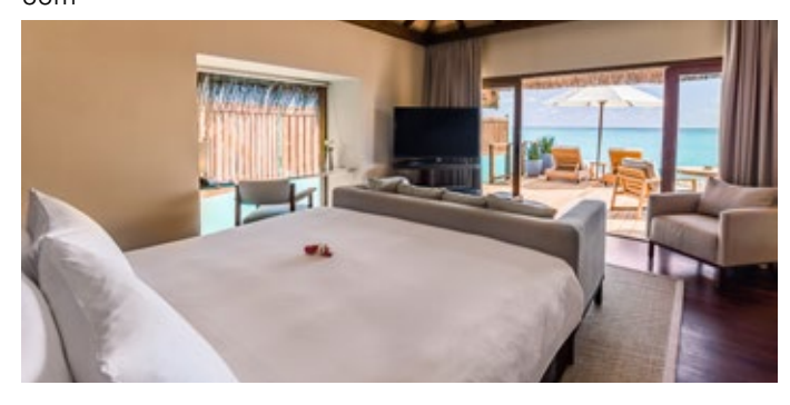
SUPERIOR WATER VILLA NUMBER OF VILLAS: 12