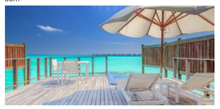
DELUXE WATER VILLA NUMBER OF VILLAS: 6